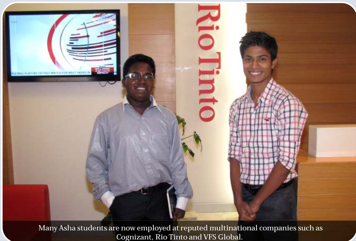
Many Asha students are now employed at reputed multinational companies such as Cognizant, Rio Tinto and VFS Global.