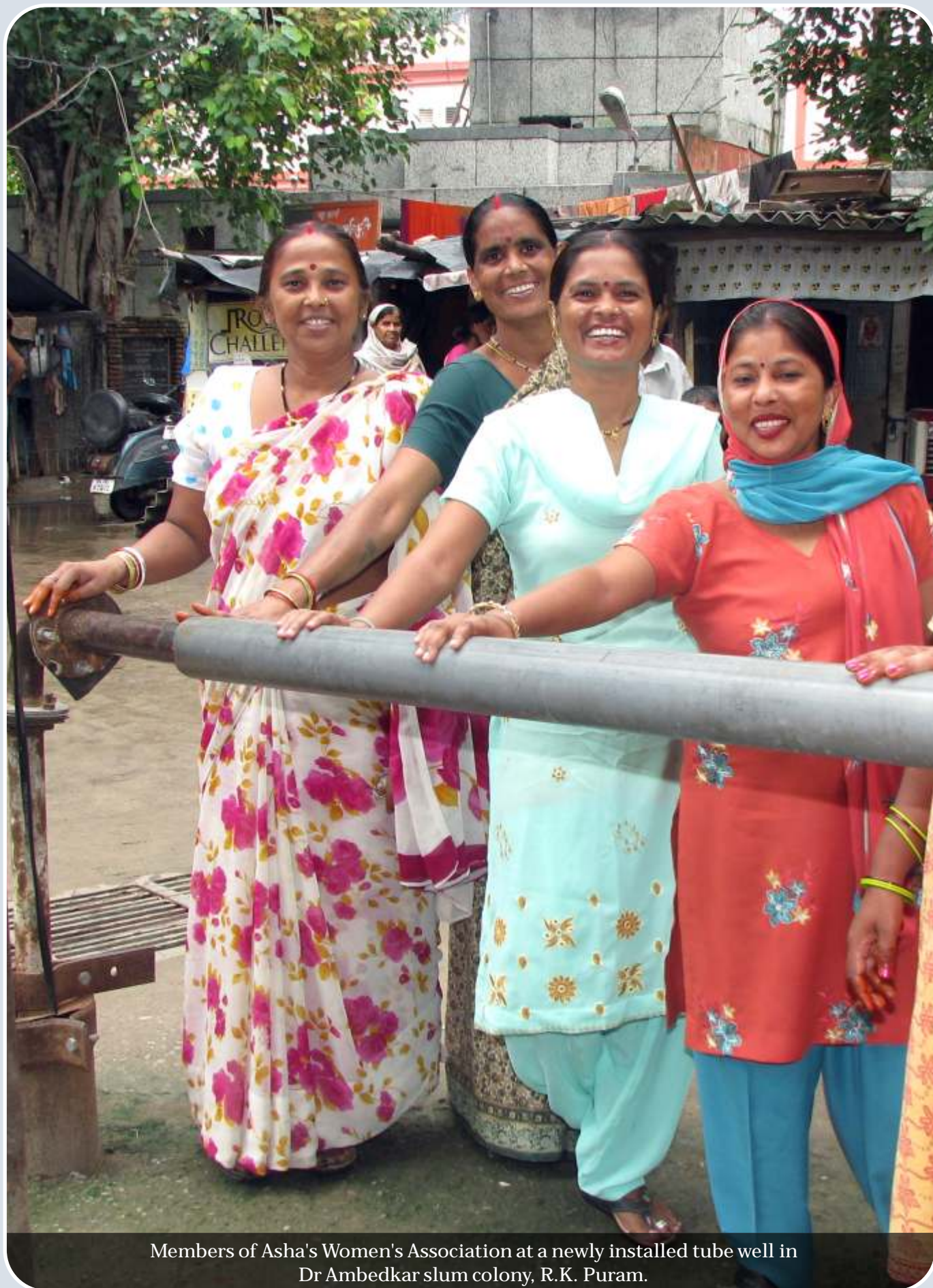
Members of Asha's Women's Association at a newly installed tube well in Dr Ambedkar slum colony, R.K. Puram.