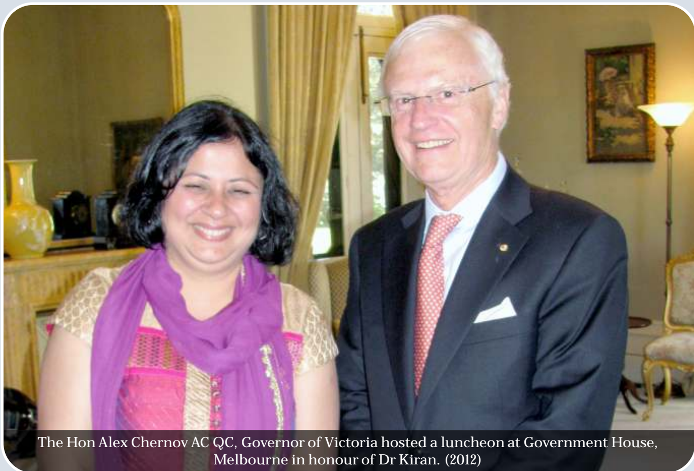
The Hon Alex Chernov AC QC, Governor of Victoria hosted a luncheon at Government House, Melbourne in honour of Dr Kiran. (2012)