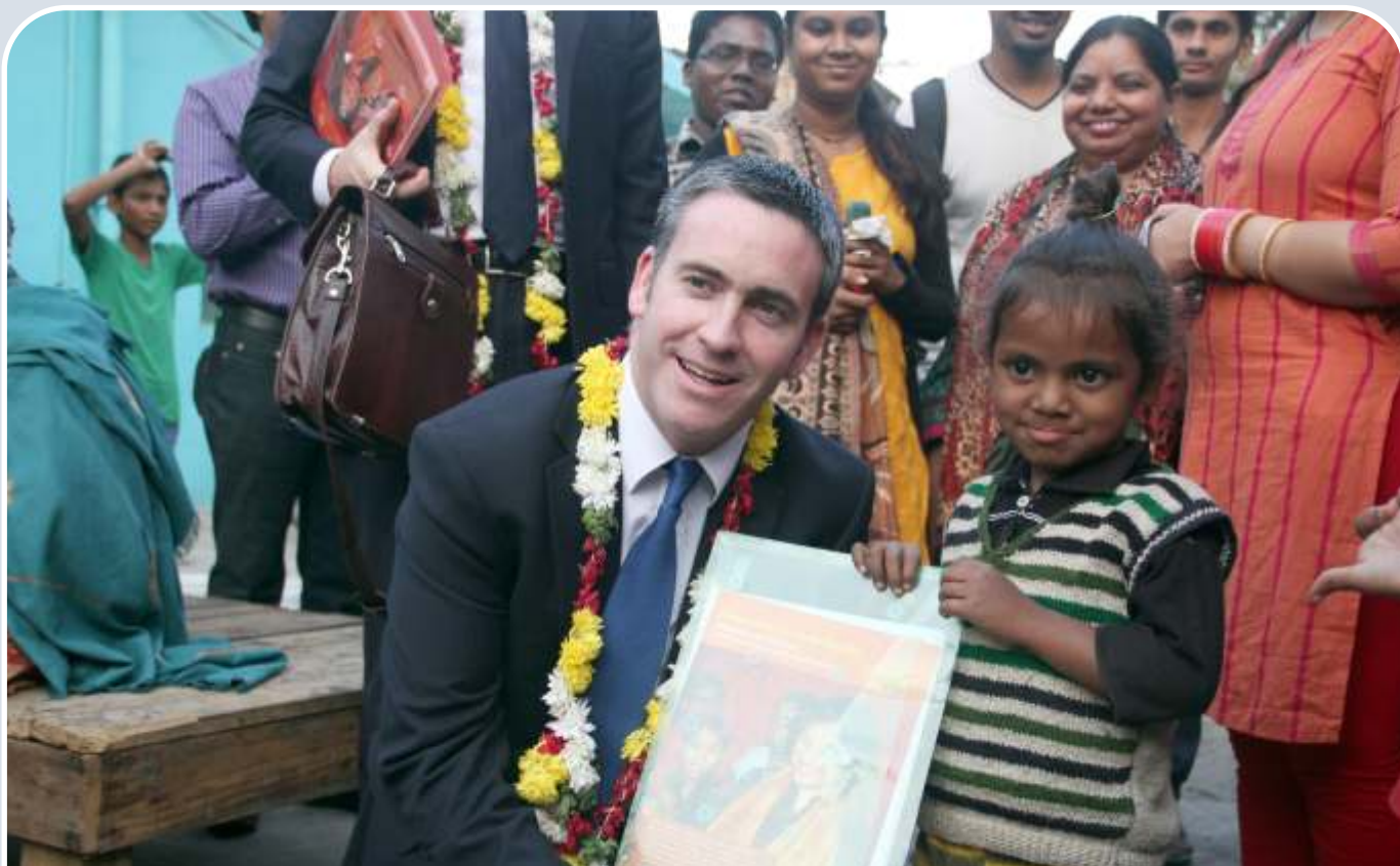
The Irish Minister for Skills, Innovation and Research, Damien English TD during his visit to an Asha community. (2014)