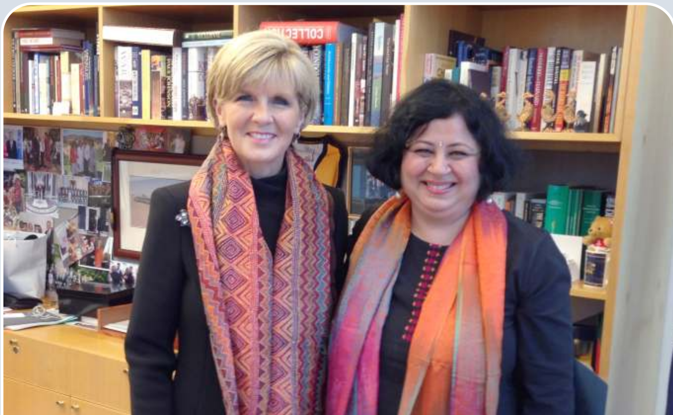
Dr Kiran was invited by Australian Minister for Foreign Affairs, Ms Julie Bishop at the Australian Parliament subsequent to the Minister's visit to Asha. (2014)