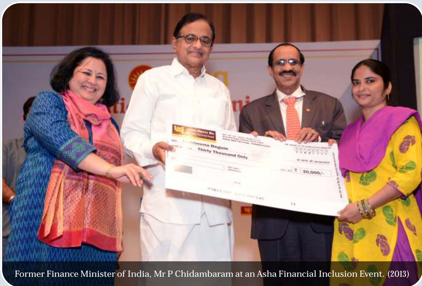
Former Finance Minister of India, Mr P Chidambaram at an Asha Financial Inclusion Event. (2013)