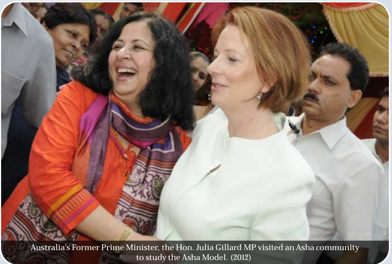
Australia's Former Prime Minister, the Hon. Julia Gillard MP visited an Asha community to study the Asha Model. (2012)