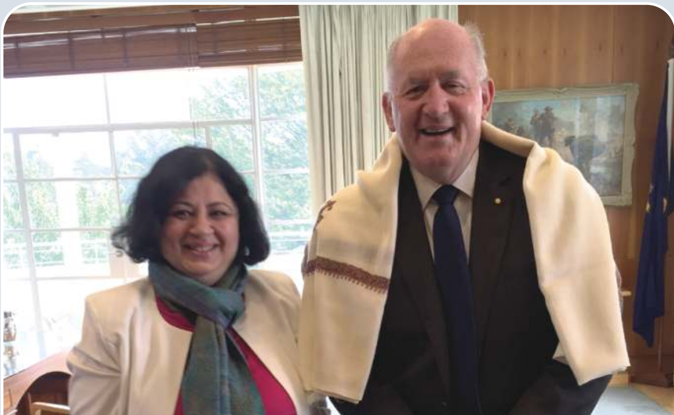
Dr Kiran calling on the Governor General of Australia, Hon Sir Peter Cosgrove AC MC. (2015)