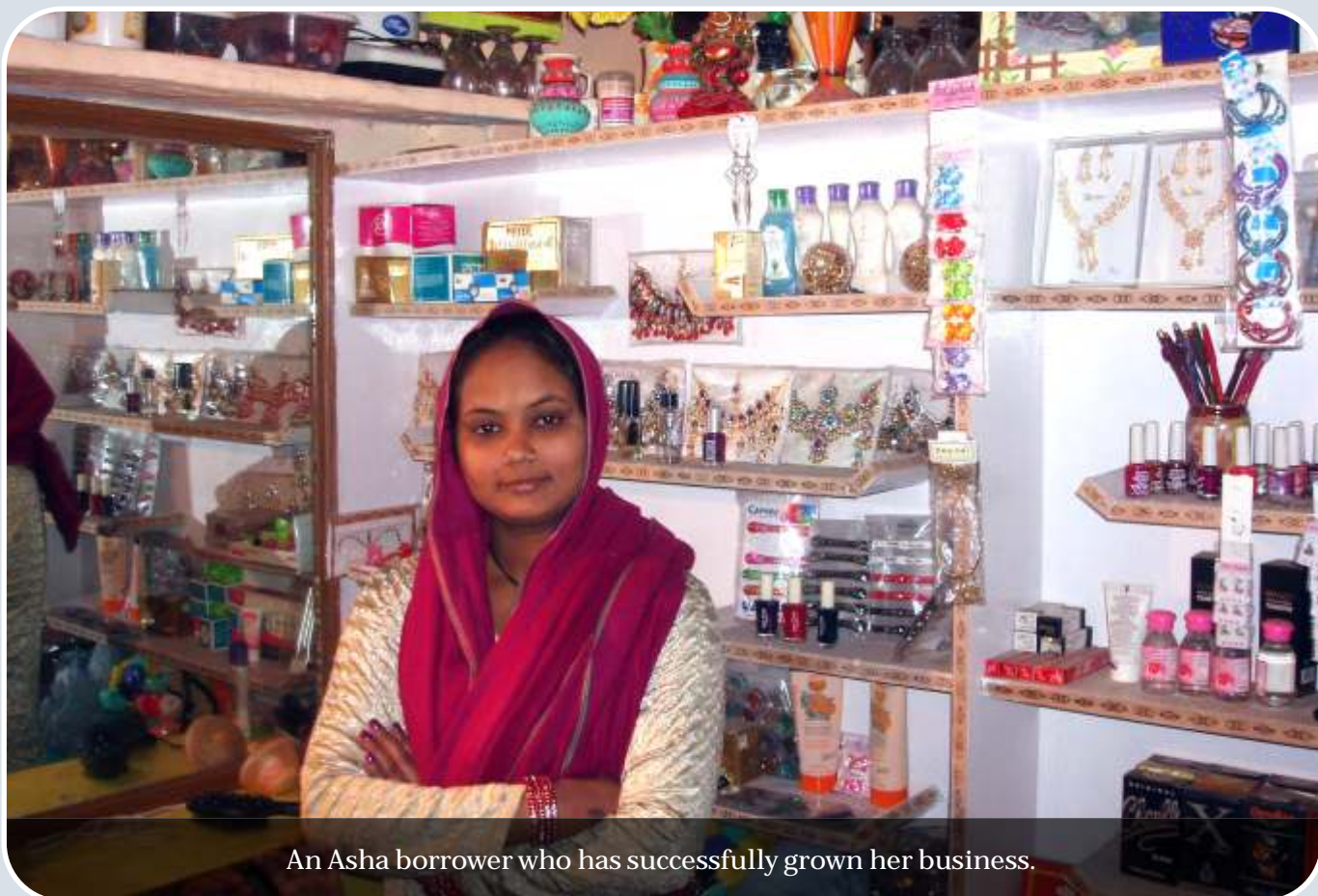
An Asha borrower who has successfully grown her business.