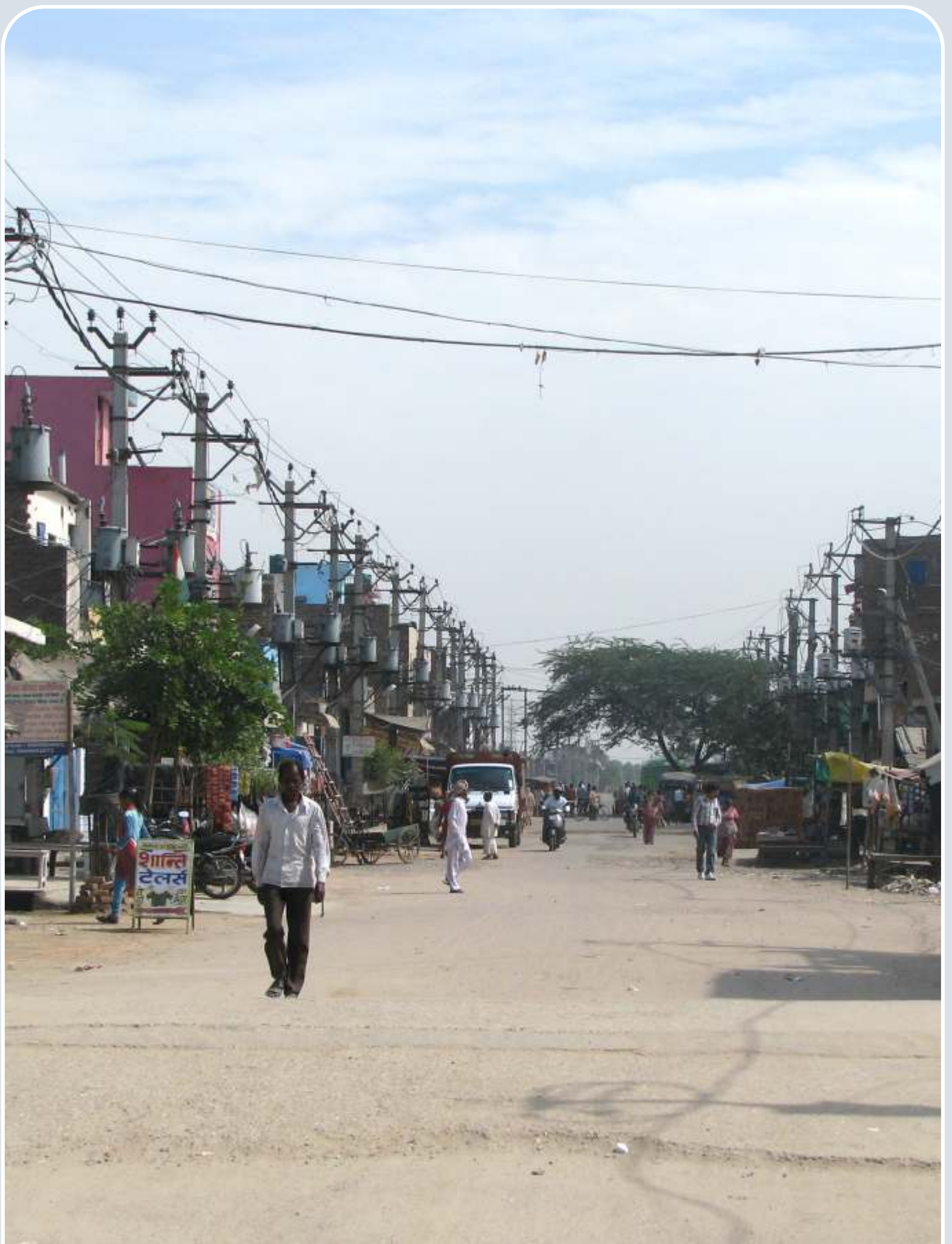
Slum dwellers receive land titles and infrastructure at Savda Ghewra through Asha.