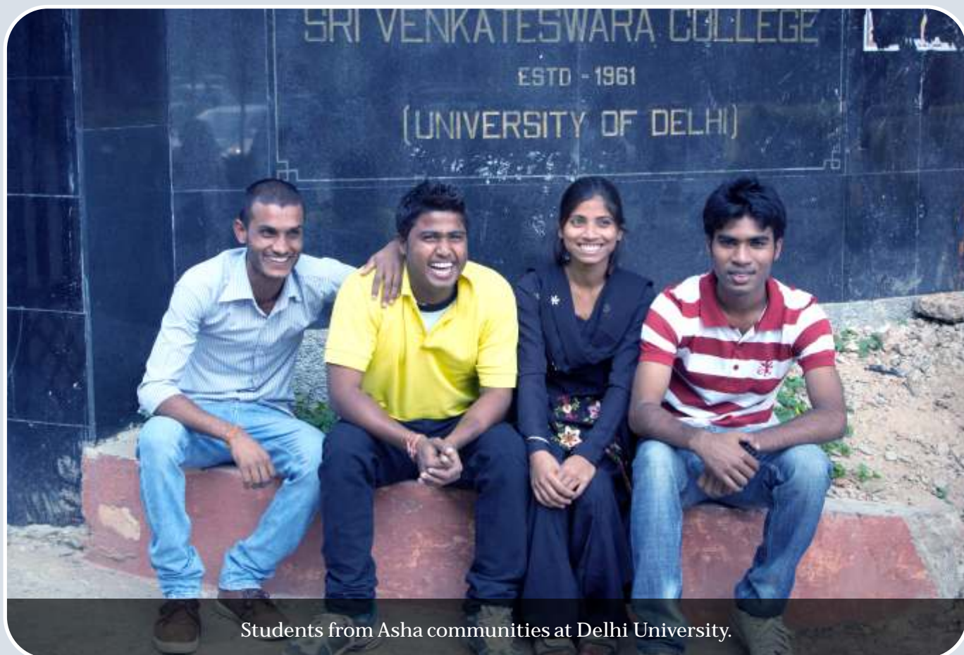
Students from Asha communities at Delhi University.