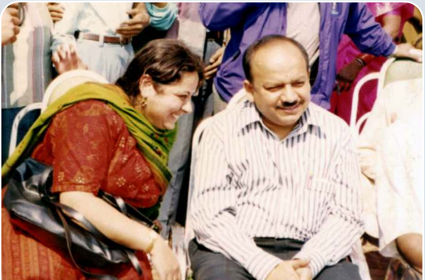
The former Health Minister of Delhi, Dr Harsh Vardhan during an event hosted at an Asha Community. (1994)