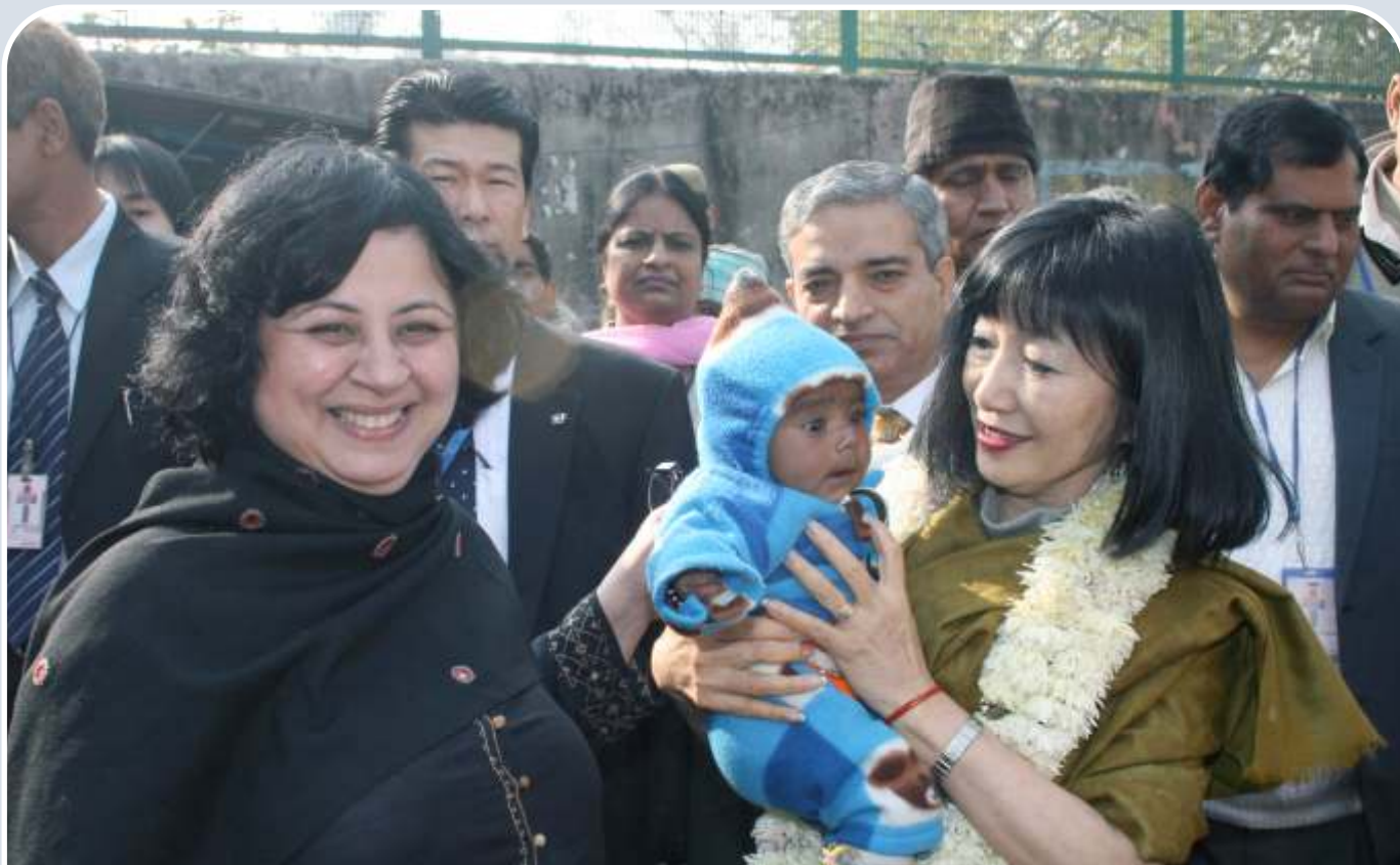
The First Lady of Japan, Mrs Miyuki Hatoyama visiting an Asha community. (2009)